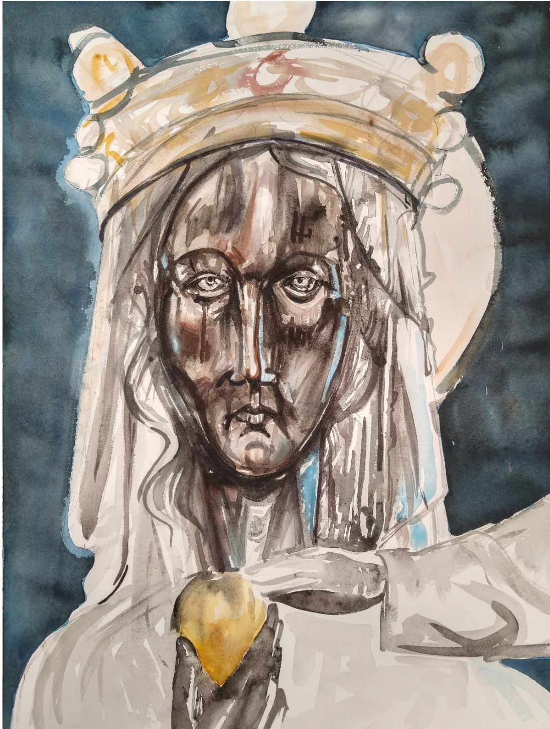
Black Madonna Watercolor and ink on Arches Paper 61 x 46 cm 2023