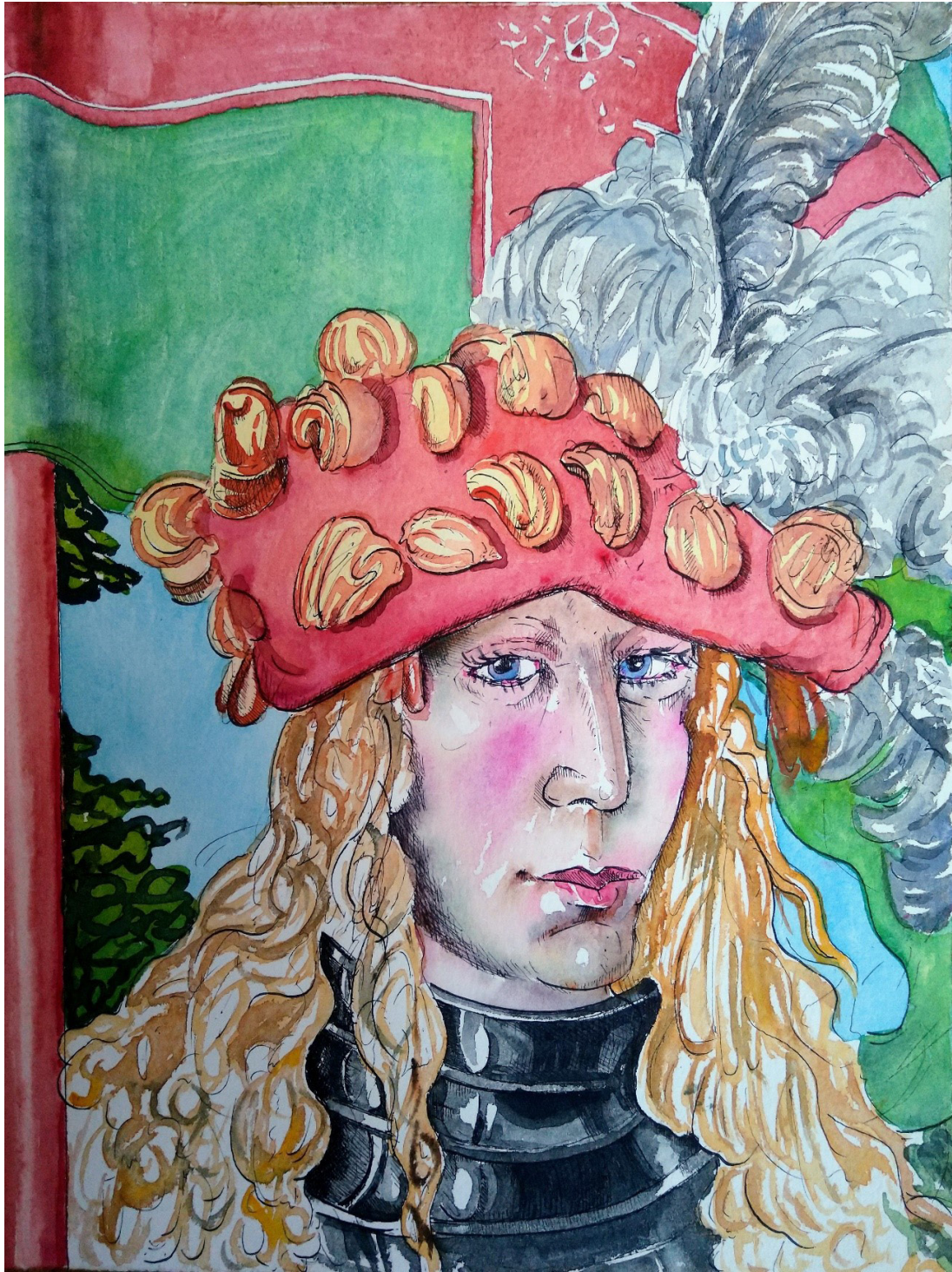
Whan the Turuf is thy Tour Watercolor and ink on Hahnemühle Paper 32 x 24 cm 2023