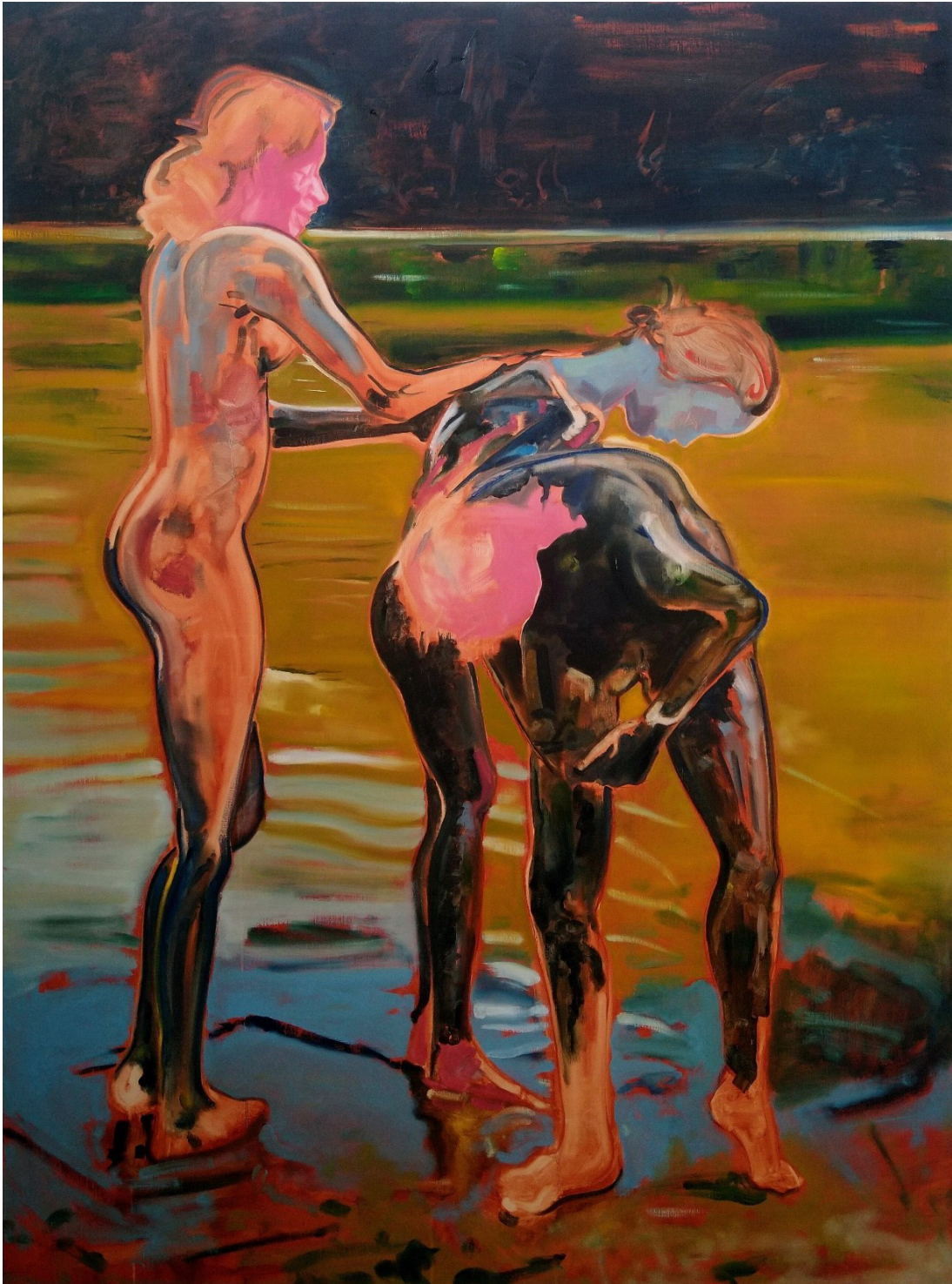
Skin Care Oil on Linen 190 x 140 cm 2023