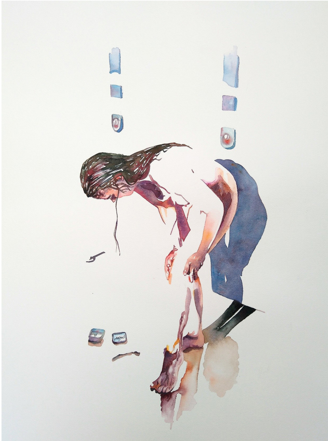
Morning ritual (Light 18) Watercolor on Arches paper 61 x 46 cm 2023