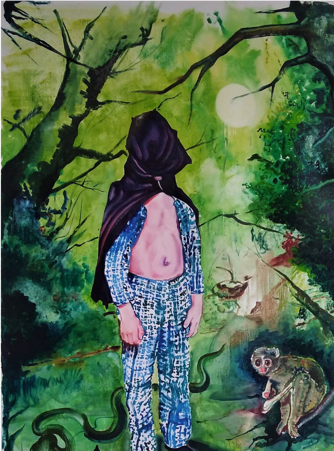
Otis Oil on linen 220 x 150 cm 2019