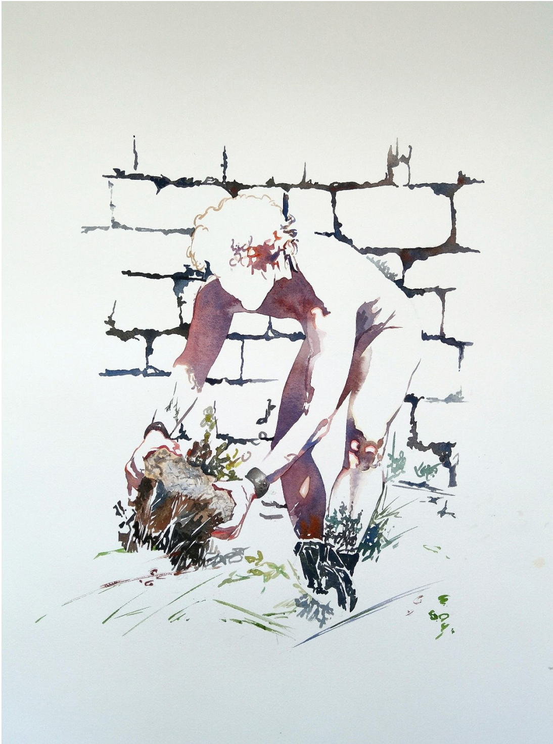
Untitled Watercolor on Arches paper 61 x 46 cm 2023