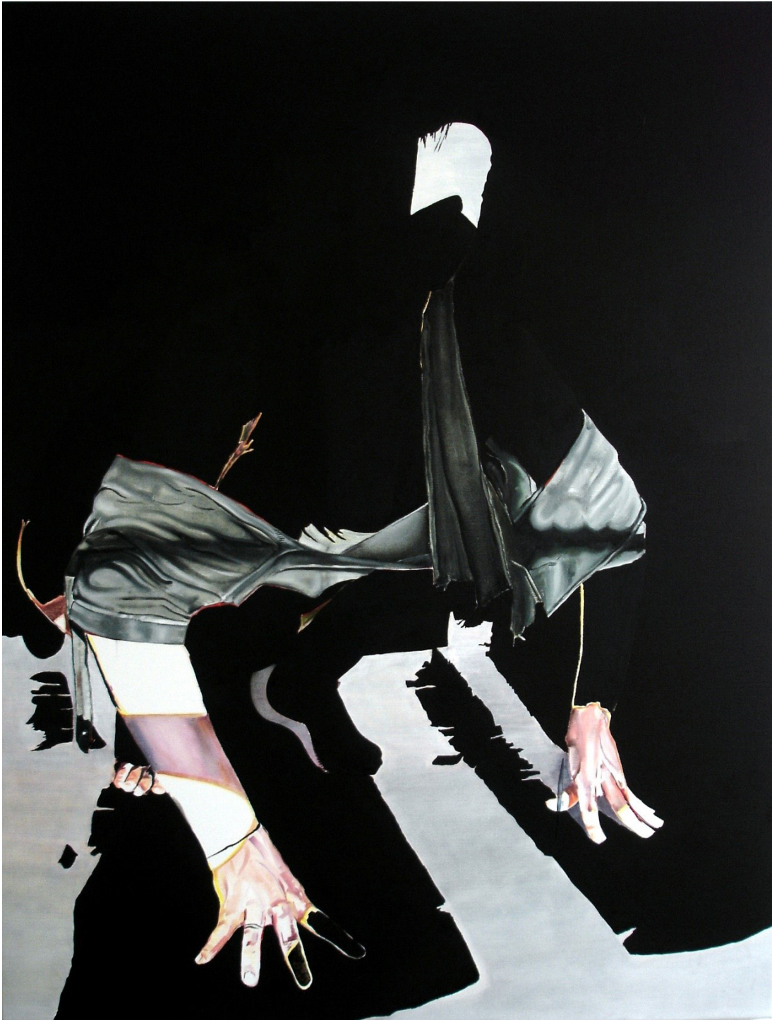
Untitled Oil on Linen 140 x 110 cm 2011