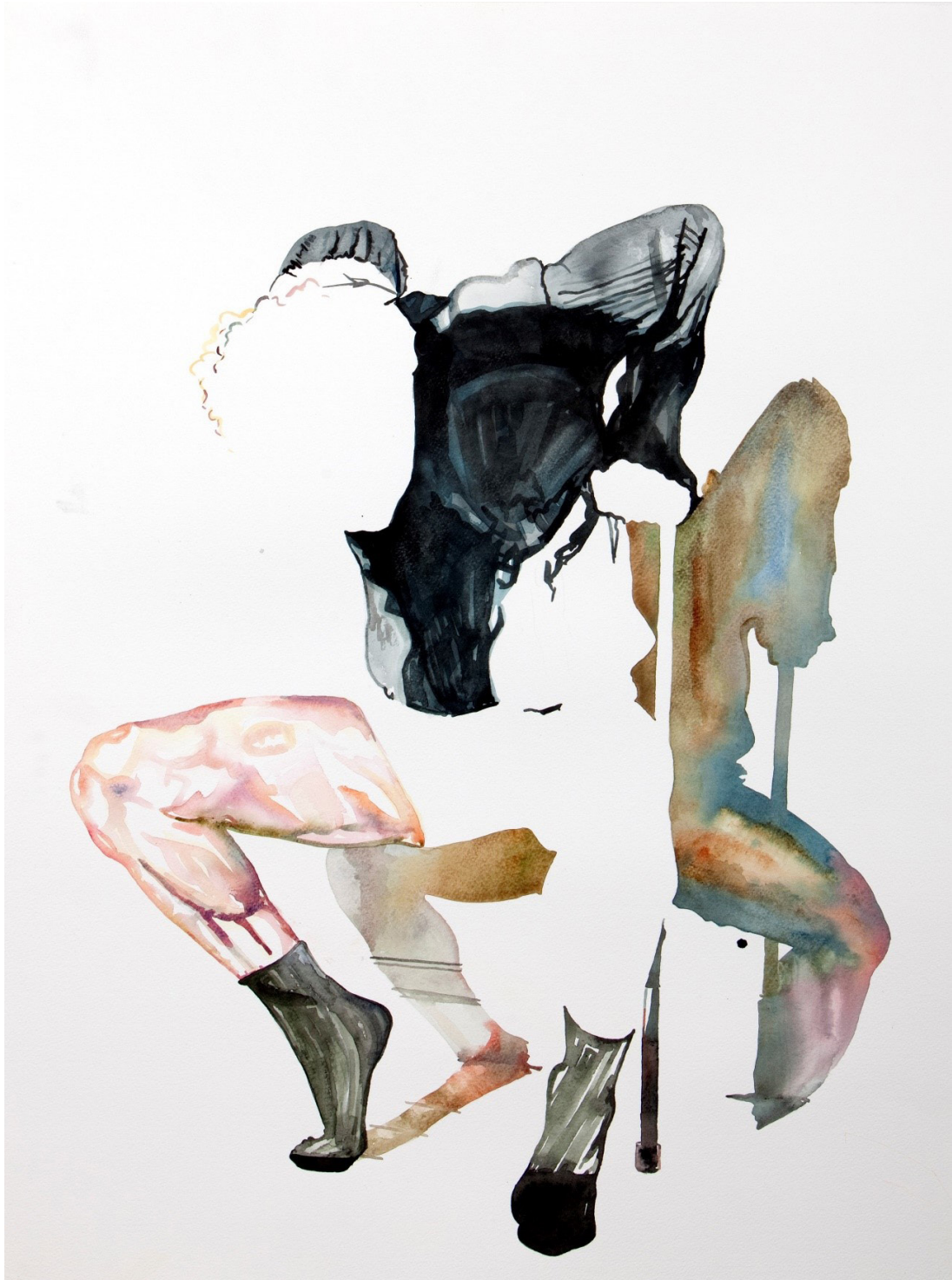
The Good Life V Watercolor on Bockingford Paper 76 x 56 cm 2012