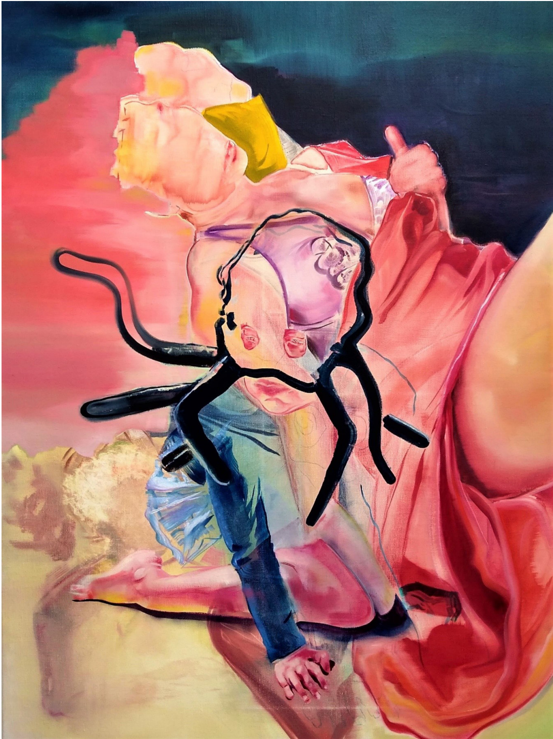
Snowwhite Oil on Linen 120 x 90 cm 2018